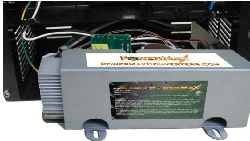
Figure 2 Powermax converter/charger